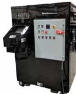
Solid State 2mm SSD

Ameri-Shred's experienced sales staff can help determine the best mobile solution for your destruction needs.