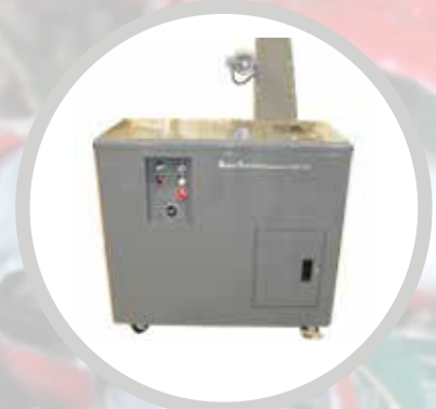
HARD DRIVE SHREDDERS