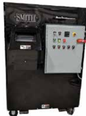
Solid State 6mm SSD