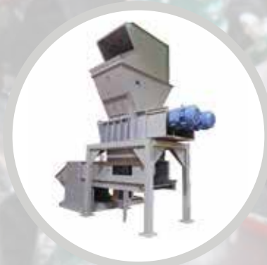
DUAL SHAFT SHREDDERS