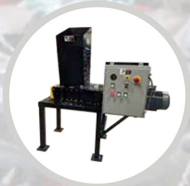
MEDICAL PLANT WASTE